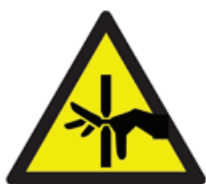
HAND JAMMING HAZARD

** This section provides safety instructions that must be followed when transporting, installing, operating the machine, performing maintenance and scrapping.