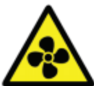
ROTATING MACHINE WARNING