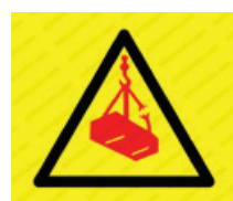
DO NOT USE UNDER LOAD